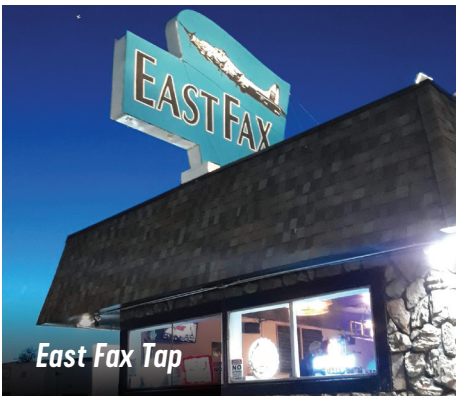
East Fax Tap