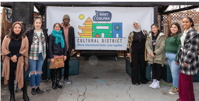
Elected officials, residents, business owners and community leaders joined The Fax team for the official unveiling of the East Colfax Cultural District logo

Chicago's Soul City, Los Angeles's Little Tokyo, St. Louis' South Grand... and now, Denver's East Colfax Cultural District! Thanks to the hard work of East Colfax businesses and residents over the last 1.5 years, the East Colfax Cultural District is moving from vision to reality.