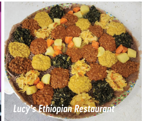
Lucy's Ethiopian Restaurant